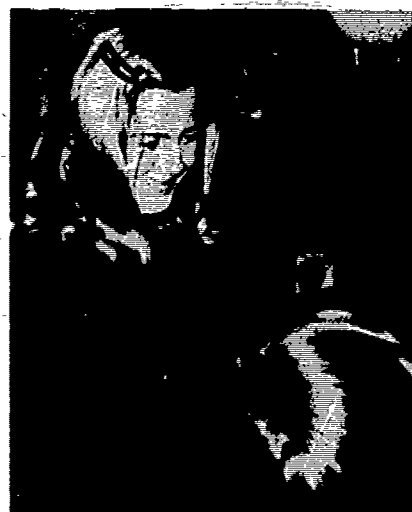
At the City Library, students help patrons with a variety of problems and questions