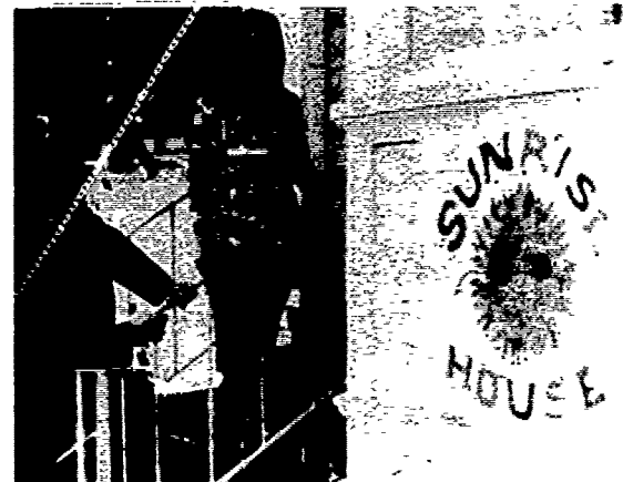
Hearing about activities of the drug abuse center, Sunrise House.

In contrast, students felt their least significant experiences were those in which