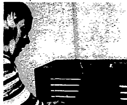
One of the activities of the City Personnel Office is its communication service