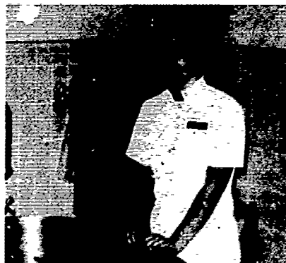
Students working with the Public Health Department often serve in one of the public clinics